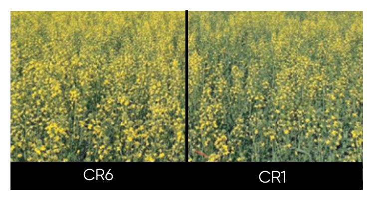
Pictures of race shift in Alberta. Source: Photo taken July, 2022 near Camrose, AB